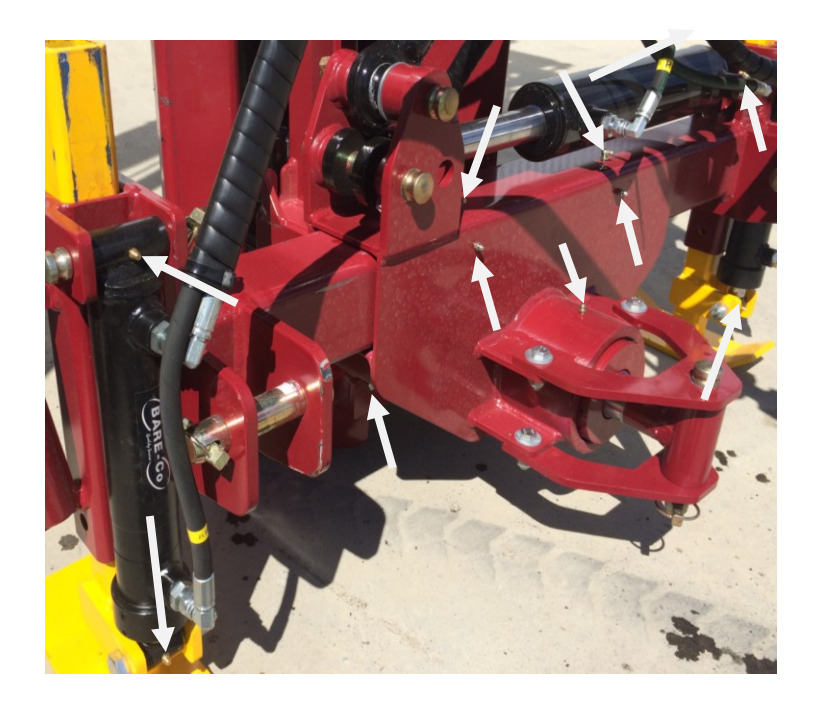
Lubricate all grease points daily as needed